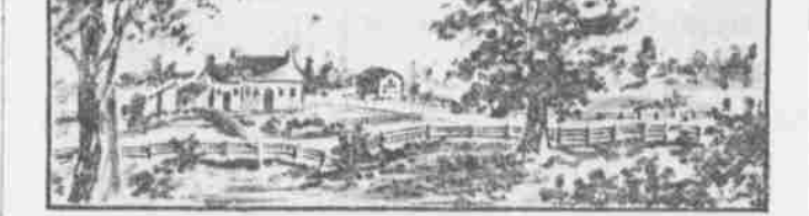
WHERE THE BATTLE OF MONMOUTH WAS FOUGHT.

All through the day the fight went on. The drill which the American