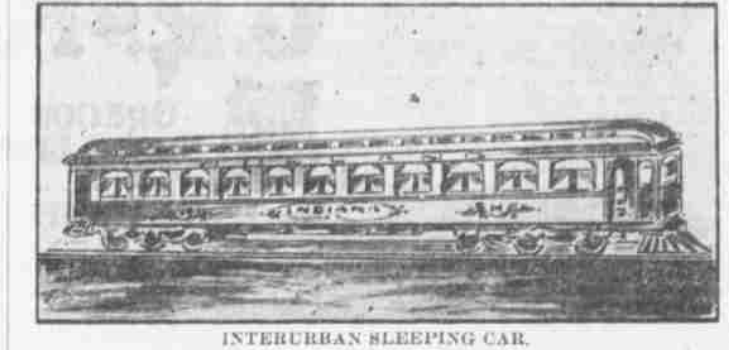
INTERURBAN SLEEPING CAR.

Before many months have passed through traffic will have been established the entire distance from St. Louis, Mo., to Pittsburg, Pa., and Cincinnati, Ohio.