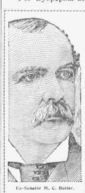
Ex-Senator M. C. Butler.