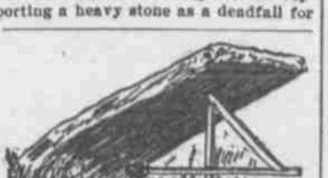
FIG. 3. DEADFALL OF FIGURE-FOUR TRAP. large animals, and another of the three sticks used in setting it. These sticks, of course, are of no regulation size, but should vary according to the size of the trap you wish to set; they should all be square, however, and from a half inch to an inch in thickness.

For animals the size of a rabbit the following dimensions will answer: The bait stick (A) should be about nine or ten inches in length, one end pointed, and the other furnished with a notch as indicated. The upright (B) should be a little shorter; one end beveled and the other square. About three or four inches from the square end, and on the side next to that beveled, a square notch should be cut, one-third of an inch deep and just wide enough to relieve the bait stick (A) without holding it fast. The third stick (C) should be seven or eight inches in length and have one end whittled to a bevel, the other being notched as shown in the cut.