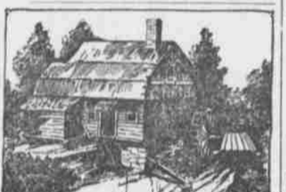
MILL IN A COUNTY OLD.

In the northern part of Morrow County, Ohio, there is a mill a century old. It is an old-fashioned water-power