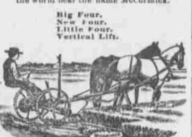
Big Four, New Four, Little Four, Vertical Lift.

The best hope of competition is to make machines "just as good as McCormick." Fifty out of every hundred mowers sold around the world bear the name McCormick.