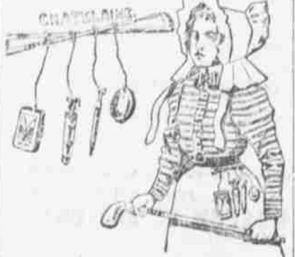
THE GOLF GIRL.

The most astonishing change in this season's fashion for golf is the introduction of the sunbonnet. But such a dainty, comical little bit of headgear never before was seen on the links. It is the evolution of the Scotch bonnet. The best of these are imported and vary in cost from $3 up to $10. The most picturesque are made of plaid Paris muslin, edged with white valenciennes lace slightly pointed at the crown and tipped comically over the eyes. The ultra-fashionable girl feels that to be quite correct she must have the insignia of the club embroidered on the lapel of her jacket. It is also good form to have the initials of the club engraved on the shining gilt buttons which fasten the jacket.