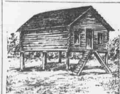
HISTORIC COURT HOUSE AT CHARLOTTE,

The memorial is in Charlotte, N. C., and its dedication, recently, marked the 125th anniversary of the signing of the Mecklenburg declaration of independence. This famous document preeded by many months the one drawn up at Philadelphia, and in consequence the first formal expression against England formulated by the colonies. The old log court house in which the band of resolute men met to assert their rights and the rights of their fellow citizens then stood in Independence square, and the site is marked by a heavy iron plate recording the fact,