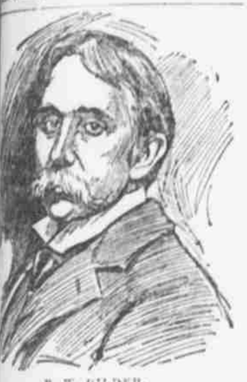
R. W. GILDER.

his position among American poets. His first volume, written under the influence of Italian studies, contained poems of much imaginative beauty. Its quality and verse since has been only received. In later years his work has shown a wide range of scope—a broadening vision and a growing purpose. As has been well said, however, "He remains nevertheless essentially a lyricist, a maker of poems; a thorough artist, who has sense, dignity and charm. His is an earnest nature, sensitive alike to contemporary problems and to the sweet voice of the Ideal."