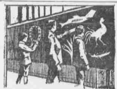
DRAWING WITH THE LEFT HAND.