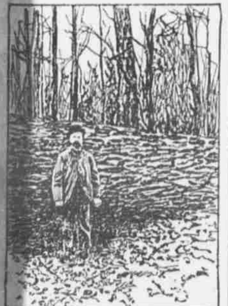
MONSTROUS LOG OF WALNUT.

The picture shows a section of one of the black walnut trees recently purchased by a Milwaukee, Ind., lumber company. There were fifty-one trees in the clump, located in Cass County, Michigan, and the price paid was $10,000 in cash. The section shown in the