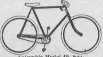
Columbia Model 40, $40.00 Hartford.....$35.00 Vedettes, Strictly Up-to-Date.....25.00 We job bicycle sundries. Write for terms and discounts.