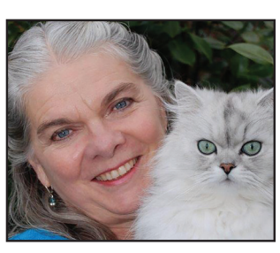
By Mary Ellen "Angel Scribe"

'Luna' in Latin means 'moon', in mythology 'moon goddess', it is an abbreviation for 'lunatic' and means 'extreme folly'.