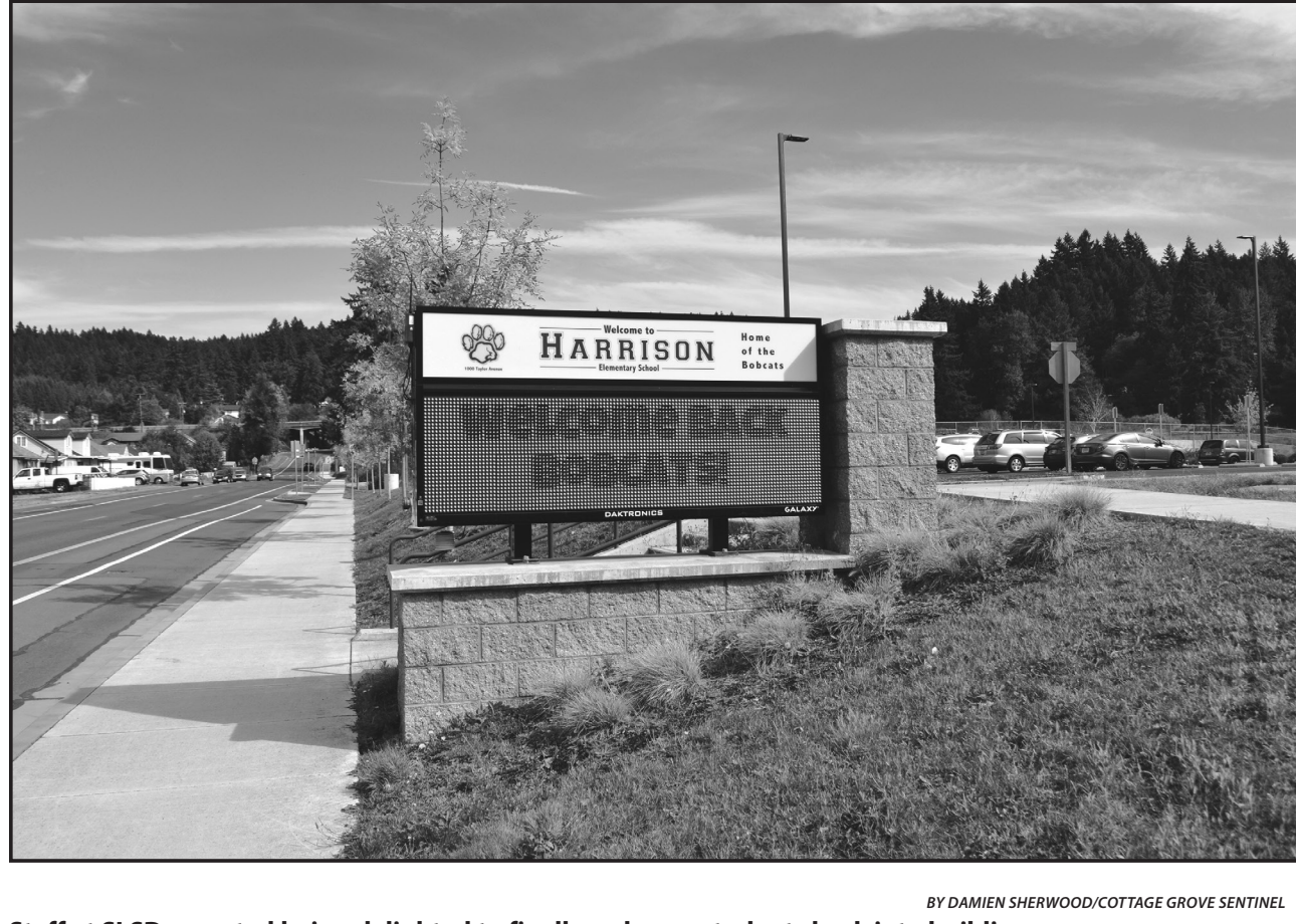
Staff at SLSD reported being delighted to finally welcome students back into buildings.

much this means to all of us and to all of our families," she said. "It has given us an infusion of hope, a reason to believe that better days are ahead."