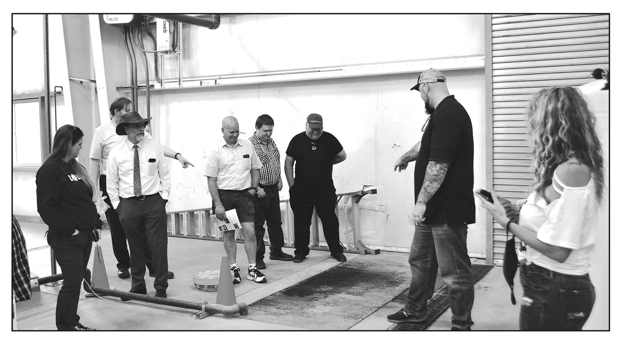
The first round of guests finished up their three-week City Utility Tours on Aug. 5 with a visit to the city's water treatment plant and one of the reservoirs. There are two more rounds scheduled over the next six weeks with members of the Cottage Grove City Council. The educational tours also include visits to the wastewater treatment plant and wastewater collection system.