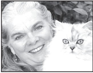
By Mary Ellen "Angel Scribe"

- That tree outside is fascinating, I could stare at it all day. - Who doesn't love a good 'yarn?' - Head-butt: verb. - Butt-head: noun. As in: "When I'm hungry, all I have to do is head-butt Gary, the butt-head, and a plate of food appears." - A tail doesn't wag itself. - Everyone's only purr-tending to be impressed. - If you have a plot snag, go back to sleep. - Take care of your nails, and they'll take care of you. - In general, leave me alone. - Paws-itive reinforcement doesn't impress me. - Only you can lick yourself. - You can try to cover up writing mistakes, but they still stink. - If you're not sure about a character, go back to