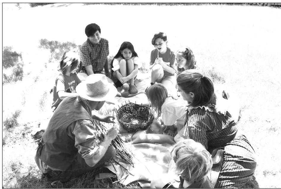
DAMIEN SHERWOOD/COTTAGE GROVE SENTINEL

Then on Oct. 2, the center will participate in the Green Living Fair, a free