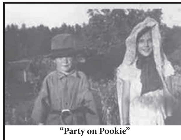
"Party on Pookie"

Call 541-942-4493 for info. FOR EMERGENCY DIAL 911 Serving South Lane County.