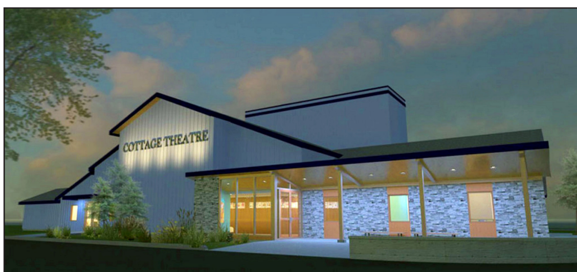
The remodel of the theater will include the addition of 50 seats to the three center sections

Safety and accessibility improvements to the facility include the addition of a fire sprinkler system (which was not required