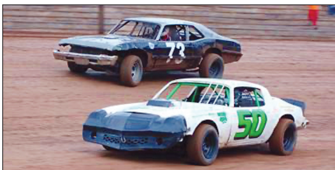
Races returned to the speedway in April and will continue through the summer.

Boyce said the best of the best will be in attendance Saturday night battling it out for the coveted Wallbanger Cup — and to be the one to scrape it along the front stretch, as is the races tradition.