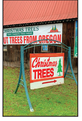
Oh, Christmas Tree! A3