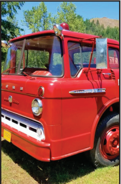
Dorena to celebrate new fire truck with parade — A3