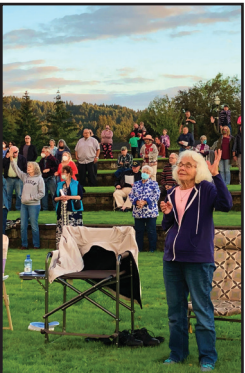
Grovers gather for National Day of Prayer — B1