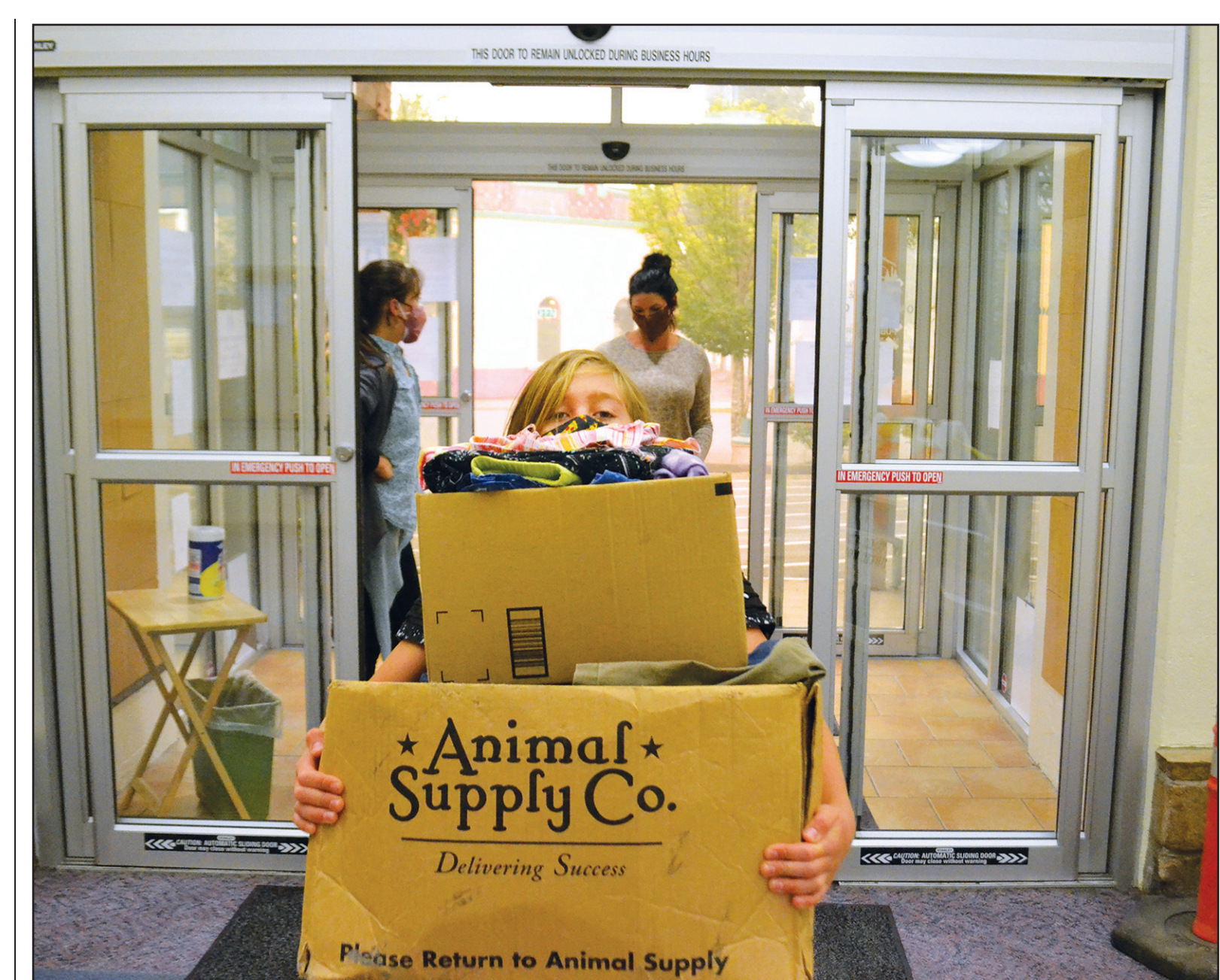
Community members collect donated items for those in the area forced to evacuate their homes due to the wildfires.