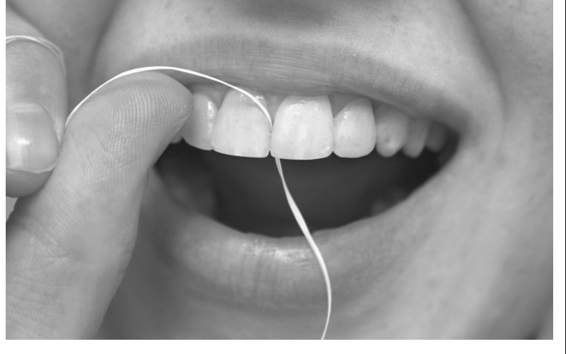
These health conditions are just a sampling of the relationship between oral health and overall health. Additional connections also have been made and continue to be studied. TF16A492

Alzheimer's disease Various health ailments, including poor oral health, have been linked to a greater risk of developing Alzheimer's disease. In 2010, after reviewing 20 years' worth of data, researchers from New York University concluded that there is a link between gum inflammation and Alzheimer's disease. Follow-up studies from researchers at the University of Central Lancashire in the United Kingdom compared brain samples from 10 living patients with Alzheimer's to samples from 10 people who did not have the disease. Data indicated that a bacterium — Porphyromonas gingivalis — was present in the Alzheimer's brain samples but not in the samples from the brains of people who did not have Alzheimer's. P. gingivalis is usually associated with chronic gum disease. As a result of the study, experts think that the bacteria can move via nerves in the roots of teeth that connect directly with the brain or through bleeding gums.