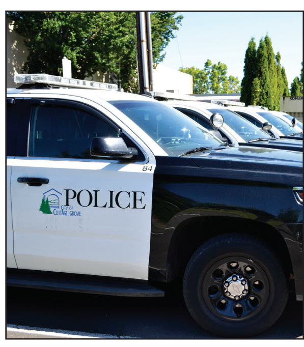
As a national debate regarding law enforcement reform rages on, the Cottage Grove Police Department prides itself on effective local policy.