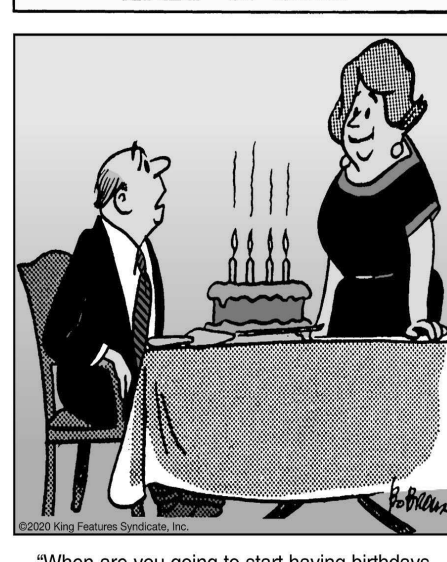
"When are you going to start having birthdays again, Irma? I'm tired of growing old alone."