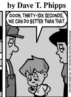
Out on a Limb