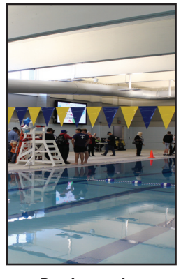
Pool opening delayed B1