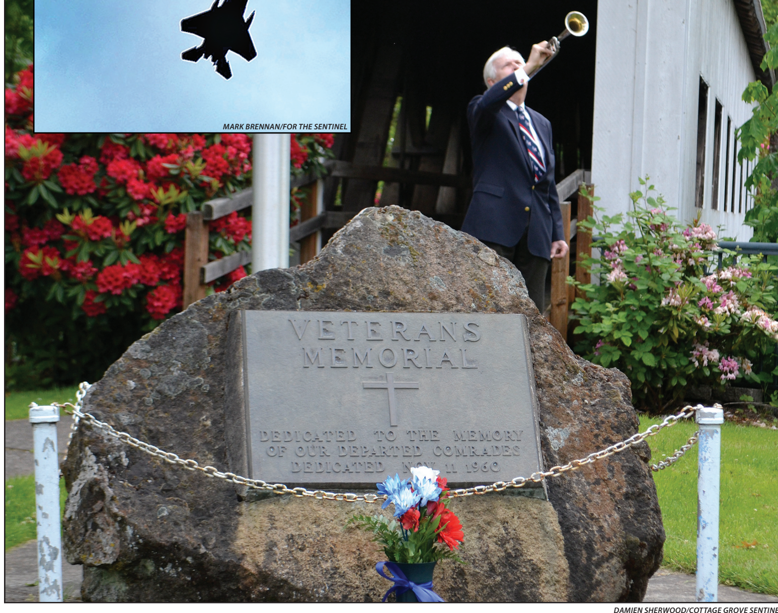
As part of Monday's Memorial Day ceremonies, fighter jets from the Oregon Air National Guard completed flyovers of area hospitals, including PeaceHealth's Cottage Grove Medical Center; "Taps" was played at the Veterans Memorial in Veterans Park.