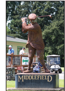
City golf course in full swing see B1