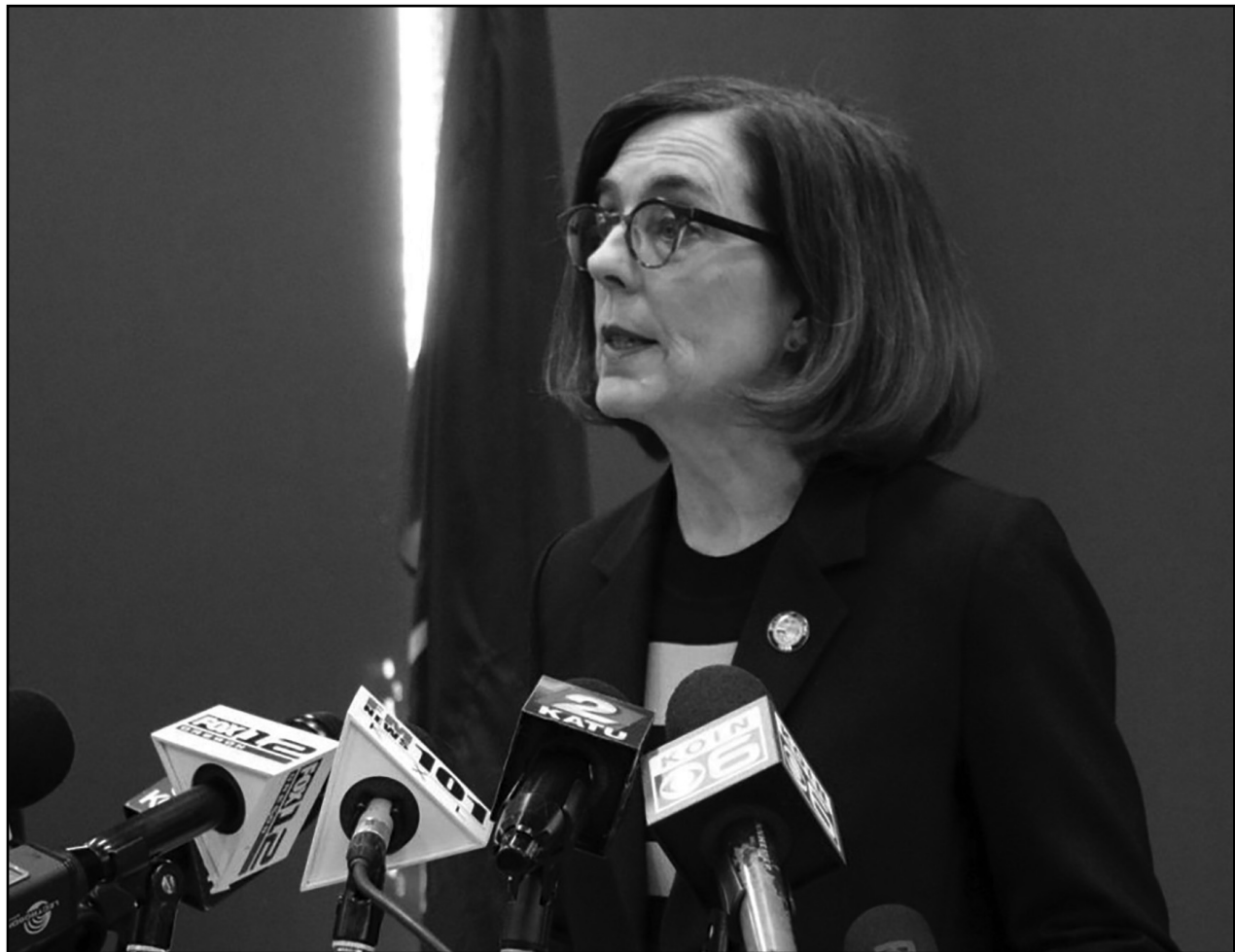
Oregon Governor Kate Brown speaks at a press conference following the announcement of the White House approving Oregon's declaration of a state of emergency in response to the coronavirus last week. The approval allows additional federal resources and economic support.

"In addition, a significant part of our disaster declaration request was for individual assistance for all Oregon counties and tribes, including childcare assistance, crisis counseling, disaster case management, disaster legal services and disaster unemployment assistance for Oregonians. That request is still also pending and would provide significant relief