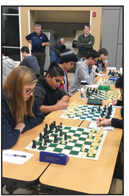
Chess in The Grove C1