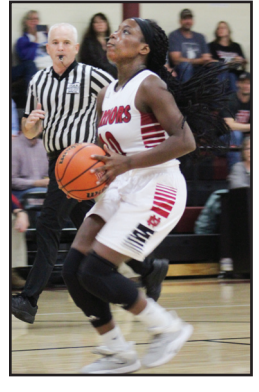
Warriors head for state tourney. В1

RECORDS Obituaries Police Logs Official releases A2