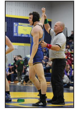
CGHS wrestling sends six to state B1