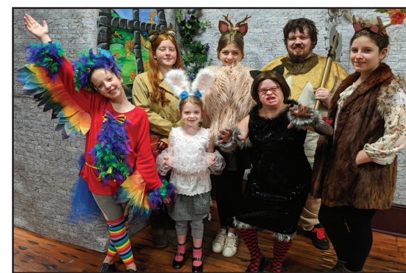
'RISE OF THE QUEENS' TO PREMIER — A5