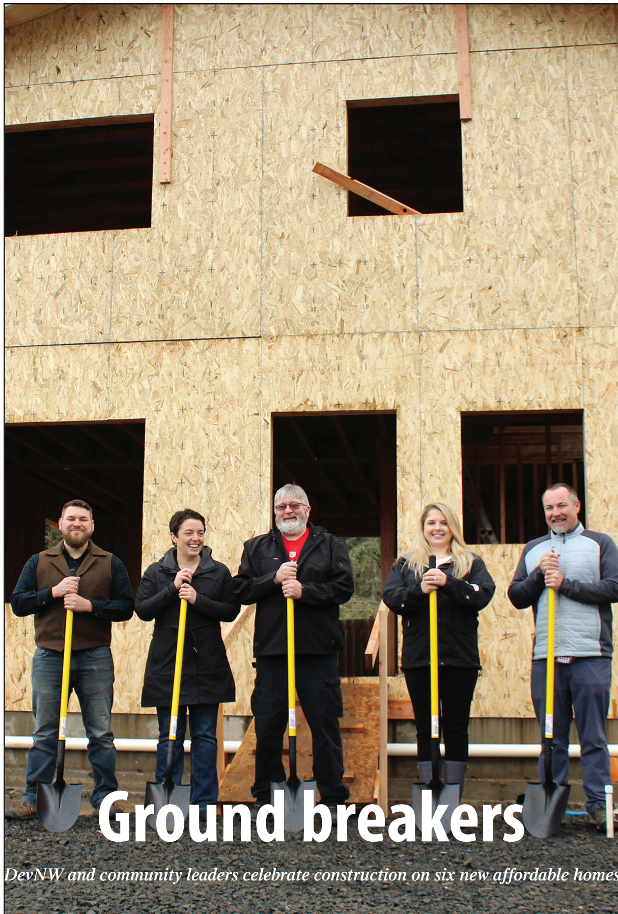
DevNW and community leaders celebrate construction on six new affordable homes