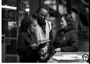
College students can get good seasonal jobs while home for the holidays—that could become the gift of a great career.

What You Can Get Perks at UPS for students home for the holidays include: 1. Flexible hours, including multiple shifts, so you can fit work into your schedule 2. Competitive hourly pay 3. The UPS Earn and Learn program, which offers eligible seasonal student employees the ability to earn up