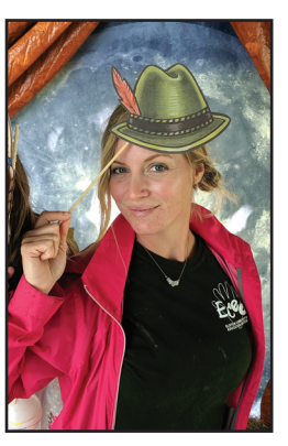
Elkton raises its glass at Oktoberfest. A3