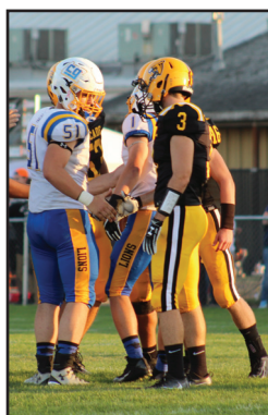
Lions get off to rocky start in week one B1