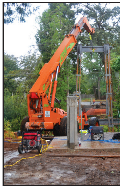
Swinging Bridge begins next phase A3