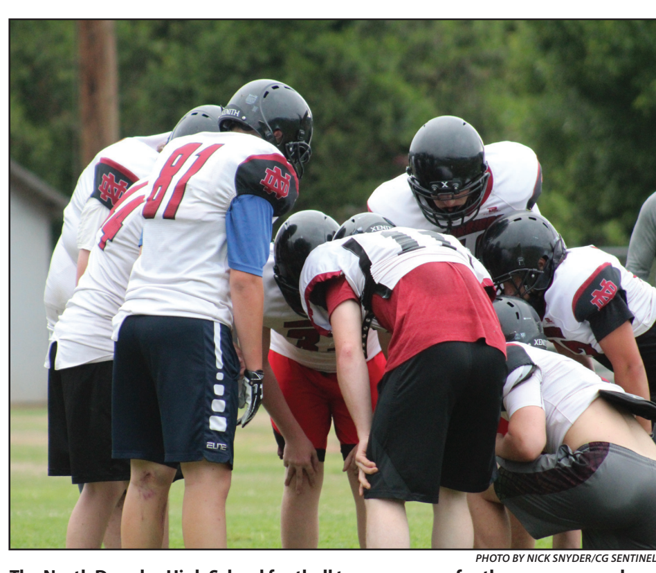
The North Douglas High School football team gears up for the season, seen here in the huddle during practice earlier in the week.