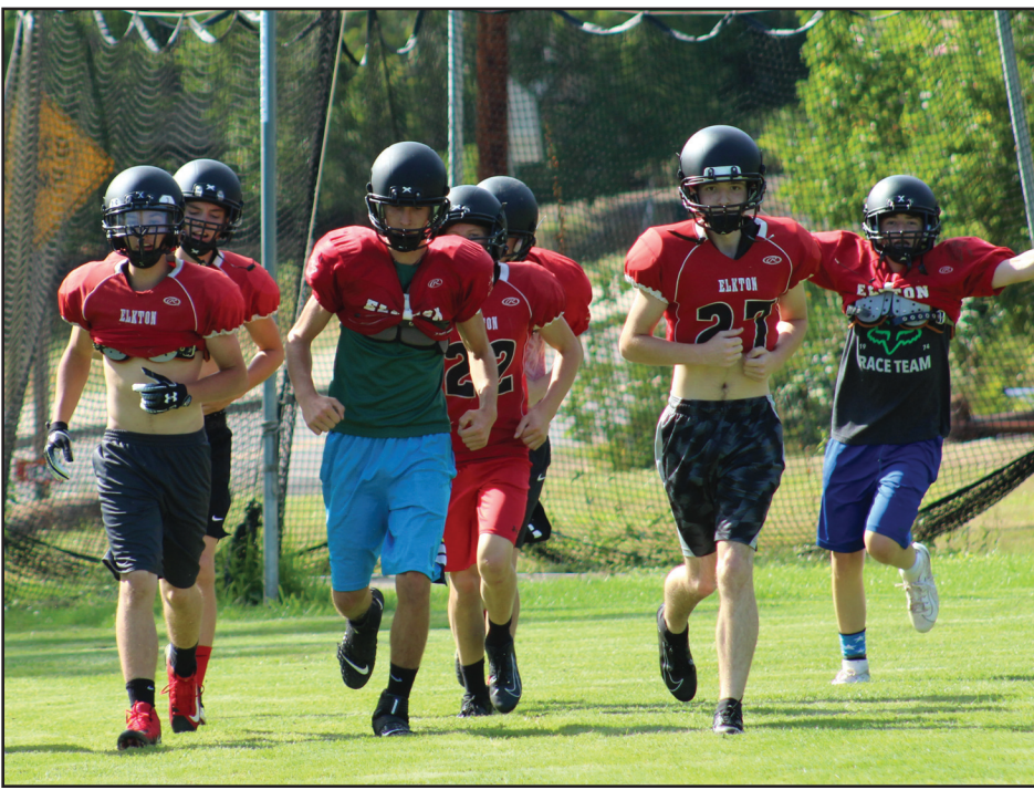
Members of the Elkton High School football team take laps around the field at