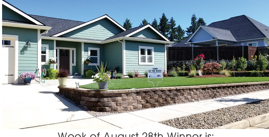
Week of August 28th Winner is: 728 Harding Place

brought to you by: Cottage Grove Sentinel 116 N. 6th • (541) 942-3325