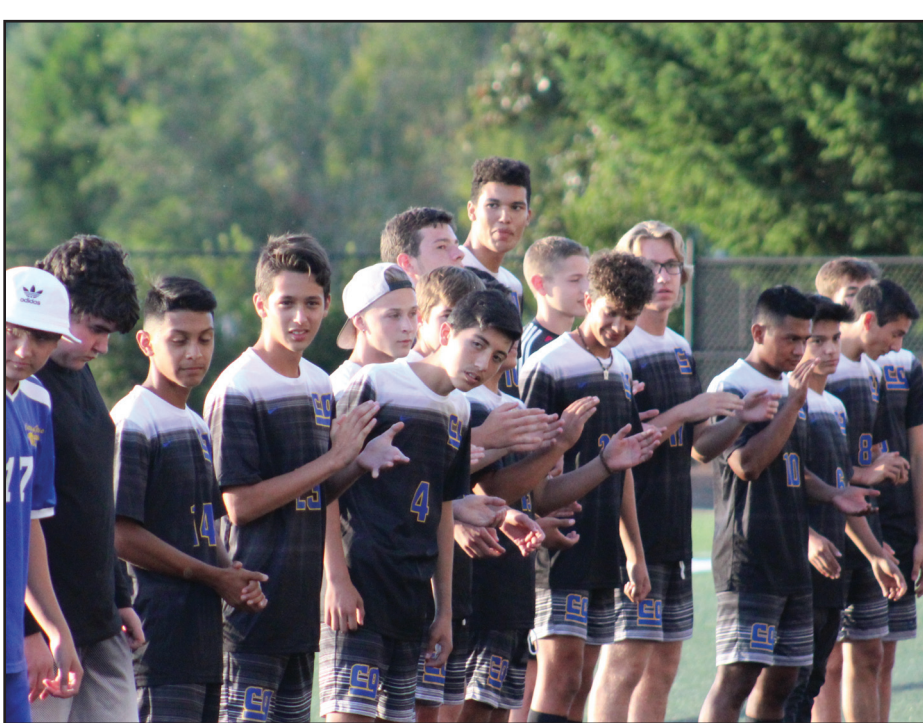
The CGHS boys soccer team is introduced. Each team member introduced themselves individually on the track in front of fans at the Meet the Lions event.