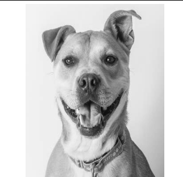
COTTAGE GROVE SENTINEL (541) 942-3325