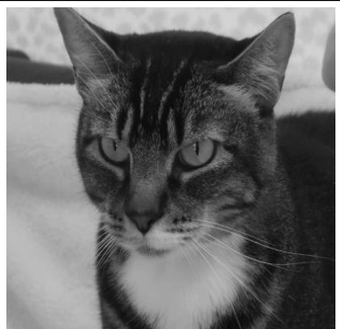
HEALTHY PET EUGENE, OR 541-343-3411