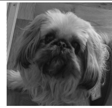
HEALTHY PET EUGENE, OR 541-343-3411