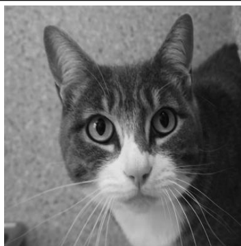
COTTAGE GROVE SENTINEL (541) 942-3325