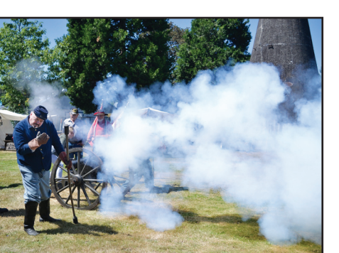
Visitors to the festival got a chance to see a Civil War camp reenactment.

By Sophia Edelblute COTTAGE GROVE SENTINEL INTERN