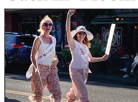
Bloomers Parade grand marshals wave to the crowd while strolling Main Street.