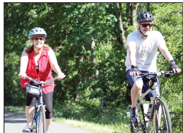
A small group of cyclists head down the Row River Trail on Saturday morning for the annual Mayor's Bike Ride. The six-mile ride started at the Row River Trailhead and turned around at the Mosby Creek Trailhead (but not before riders enjoyed a brief snack). The leisurely ride is done to encourage families and all individuals be outside and to use the Row River Trail.