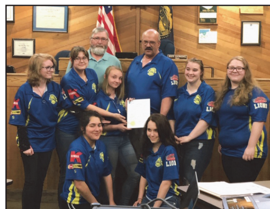
The CGHS bowling team with Cottage Grove mayor Jeff Gowing.

This week's athletes of the week are the members of the Cottage Grove varsity girls' bowling team. Last week the team was honored at a City Council meeting for their successful season.