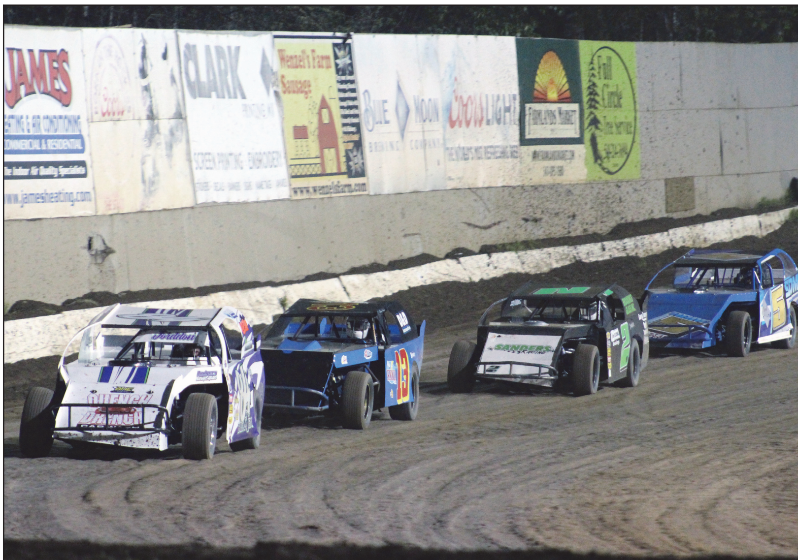
IMCA Modifieds race at the Cottage Grove Speedway on Friday night. After five weeks of cancelled races, the weather held up and allowed fans to flock to the Speedway over the weekend to watch the Spring Fling. To read more about the races, turn to B2.