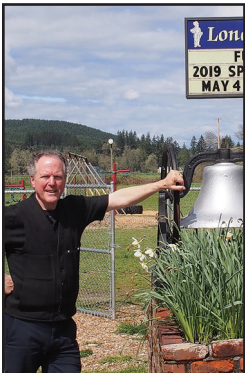
Oregon's Poet Laureate visits LES A5