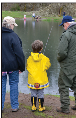
Family Fishing Day INSIDE — A3