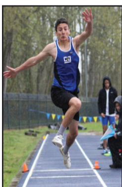
CGHS track and field take on Sky-Em INSIDE — SPORTS

• RECORDS Obituaries Police Logs Births A2