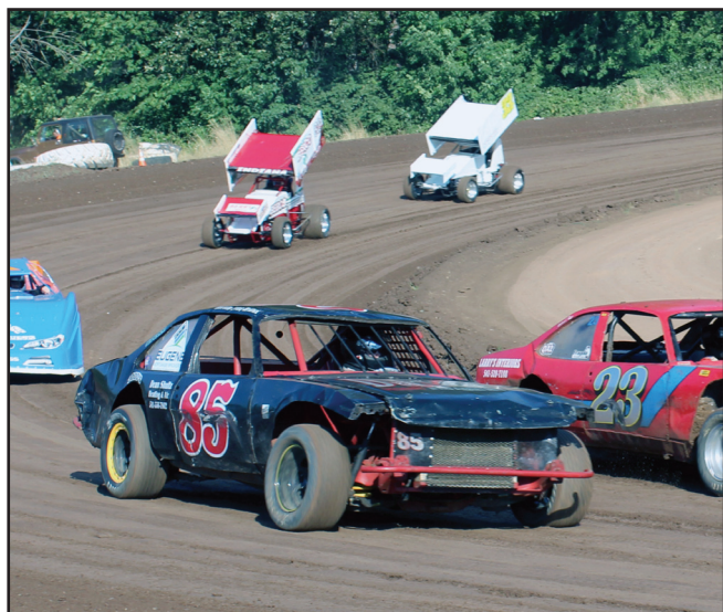
A race takes place at the Cottage Grove Speedway in previously sunny days. The season has been pushed back due to the wet track.