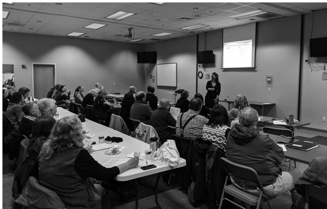
Chamber Forum: Non Profit Board Training