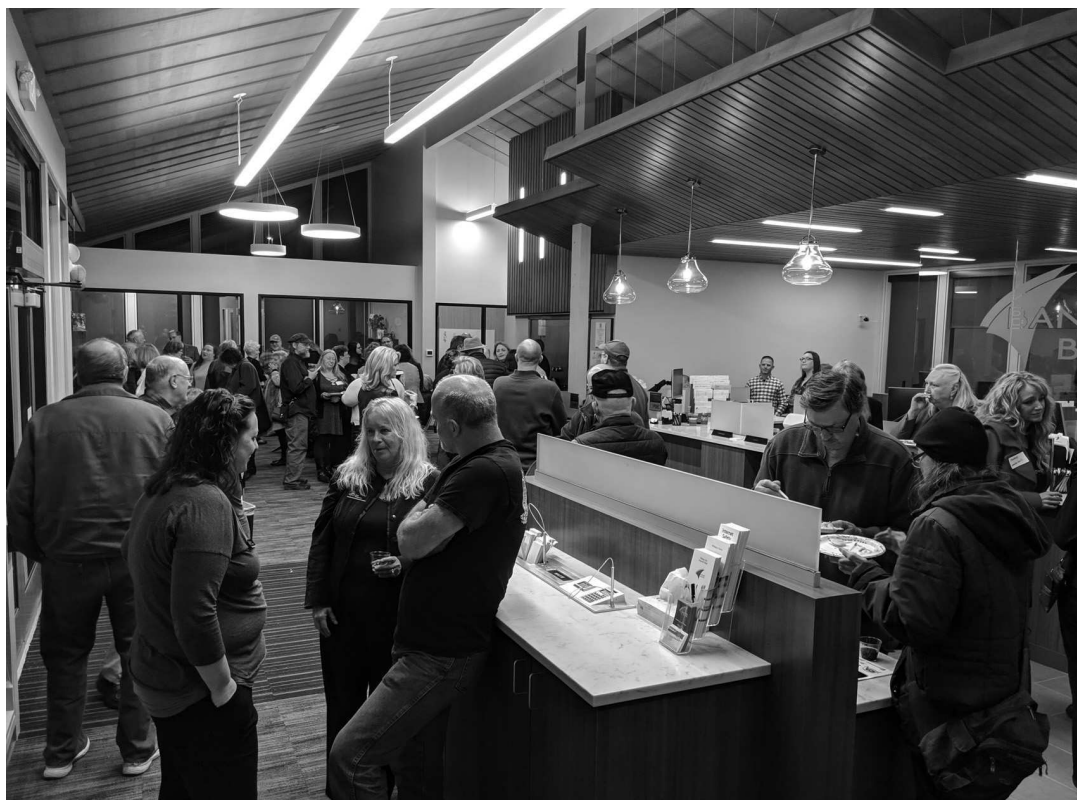
Business after hours at Banner Bank, Cottage Grove.

We hope that all of our member businesses are back on track after the big snow storm. We'd like to gather information about what your experience has been in the aftermath and how it has affected your business. What will help your business recover more quickly after the next big event? What resources would have made a difference in being able to serve your customers? The snow storm is sure to be talked about for a long time. It can be a cautionary tale or a learning experience. Our hope is to gather as much information as possible and use your experiences help the entire business community to be more prepared for whatever lies ahead.