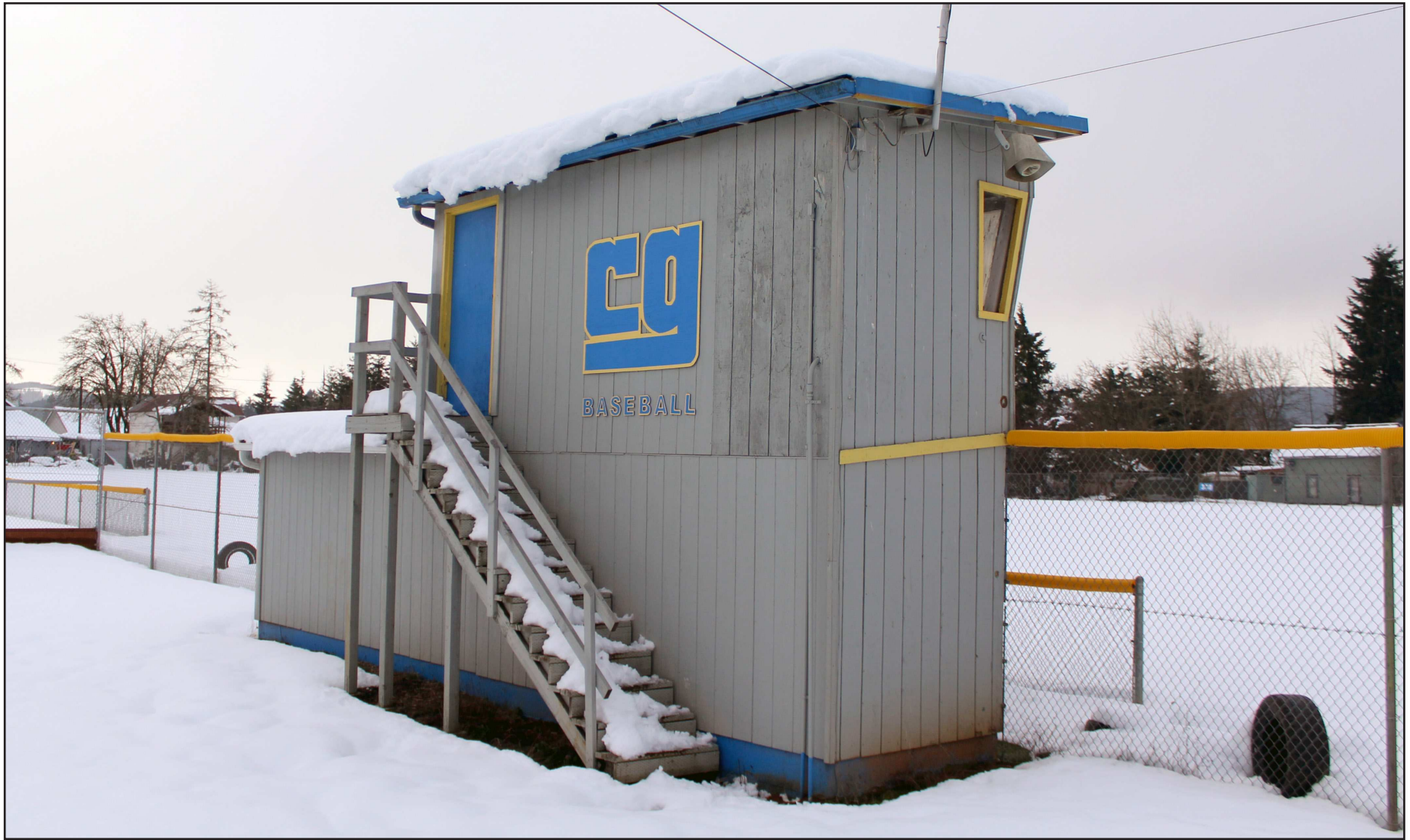
The snow slowly but surely begins to melt at Kelly Field in Cottage Grove on Thursday afternoon.