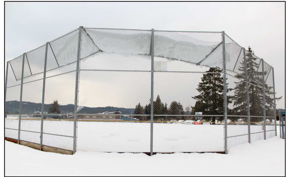
The weight of the snow bends in the top of the fence at the Cottage Grove softball field last Thursday afternoon.