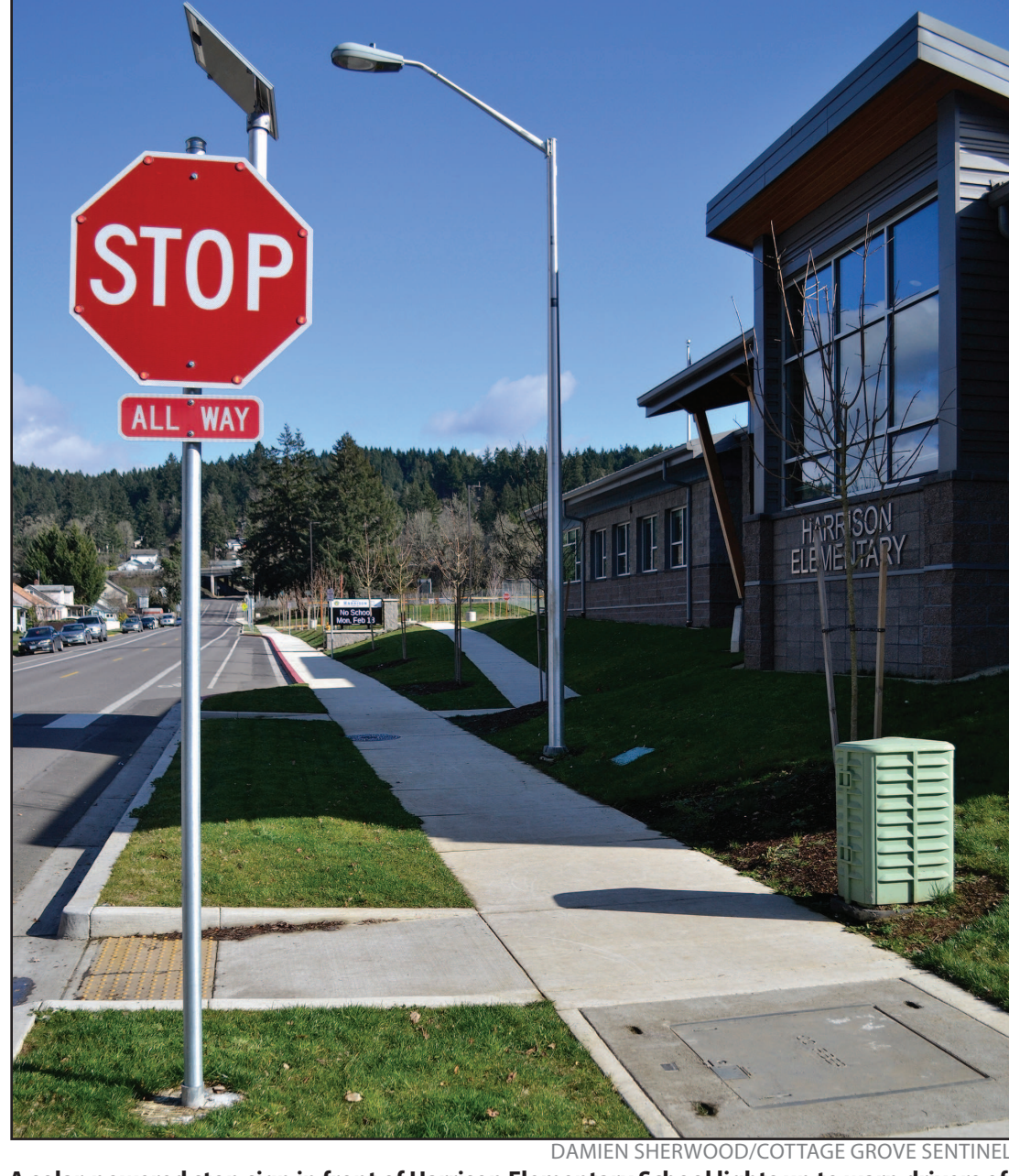
A solar-powered stop sign in front of Harrison Elementary School lights up to warn drivers of pedestrians.

Total costs have yet to be assessed, so no estimates exist on what landowners can expect. However, the city has set a milestone in its grant agreement to engage in community outreach twenty weeks from the agree-