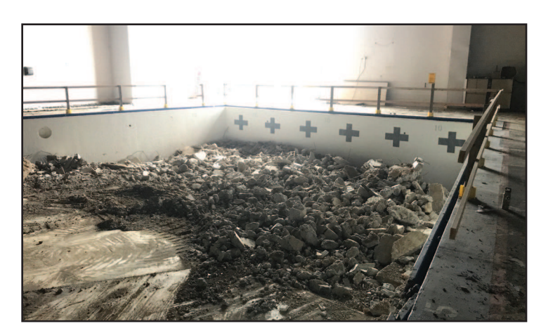
The pool closed in October of this year and is expected to open again in 2019.

Included in the packet for the board are estimates of what the school would look like over the next five years if it stays open and what the realities of closing the school would entail. The report will also include conversations with current Latham teachers and staff members in