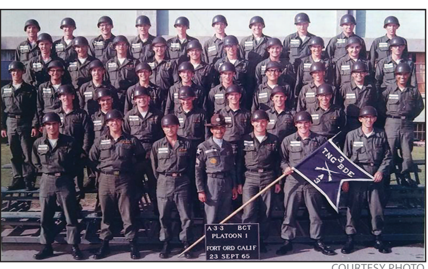
Platoon A-3-3 stands for a photo in 1965. The platoon was comprised of 44 men, all from Oregon. Four men were Cottage Grove residents and three, returned to town after the war.

Three of them stayed and worked at Weyerhaeuser. Two of them still pass