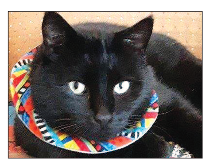
Everyone has a black "Shadow," but Shanon's is an unusual brave-black cat.

Shadow's sense of humor has him dash ahead of everyone, hide and then mischievously jump out startling them. He once shockingly dropped out of a tree in front of Shanon like Spider-