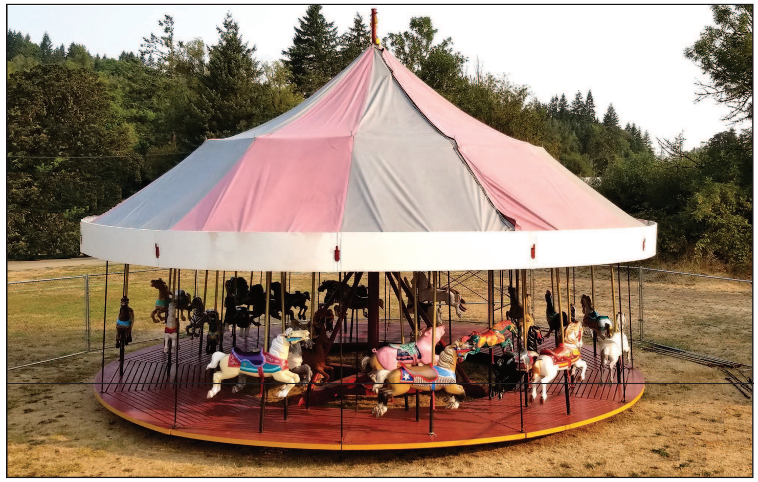
The Main Street Carousel will temporarily be housed at Brad's Chevrolet until a permanent home can be found.