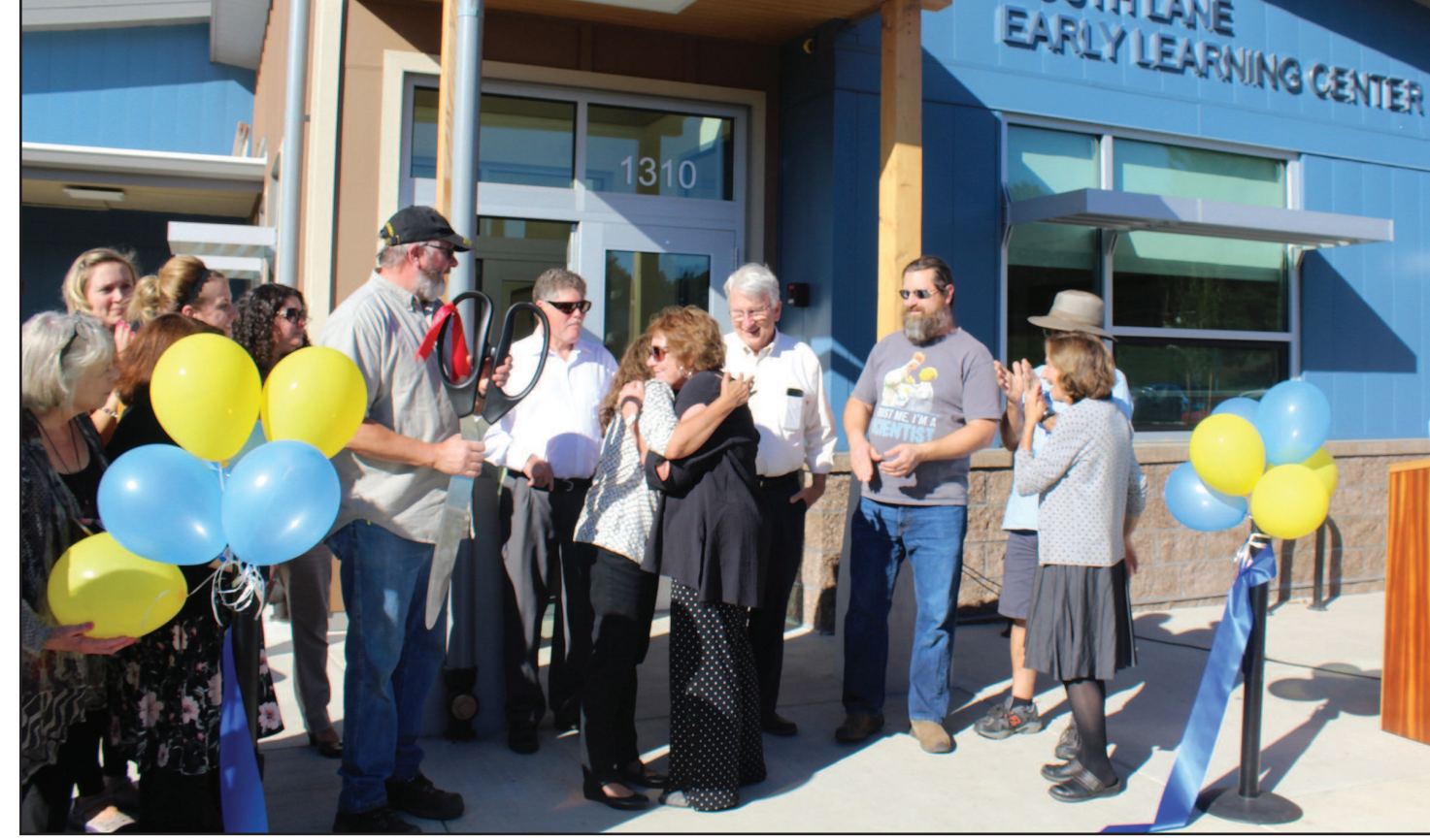
Members of the community were on hand for the official ribbon cutting to Early Learning Center on Sept. 20. The program provides resources for parents and children in the South Lane School District.

In 2016, voters approved a $35 million bond for upgraded security and technology around the school district as well as the construction of a new elemen-