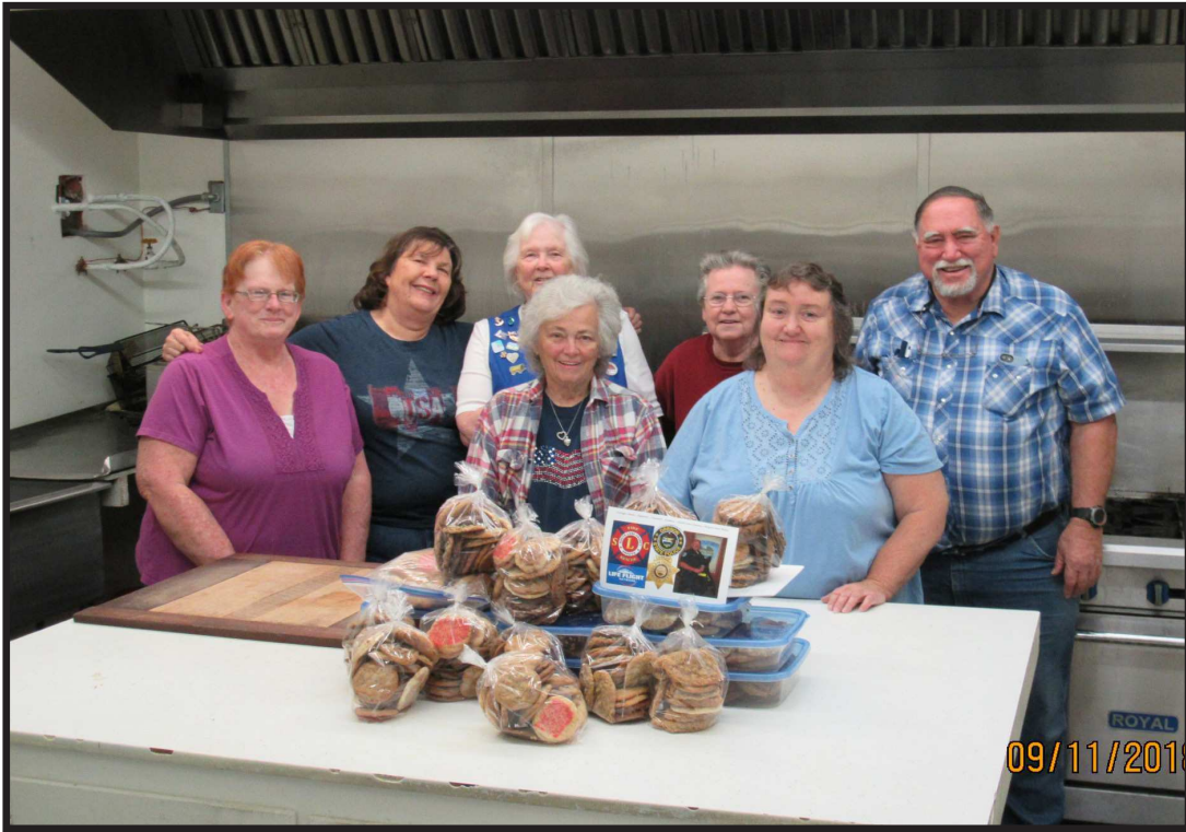
Members of the VFW Auxiliary bakes cookies for local patriots around South Lane.

116 N. 6th St. • cmay@cgsentinel.com • zsilva@cgsentinel.com • facebook.com/cgsentinel • twitter.com/cgsentinel