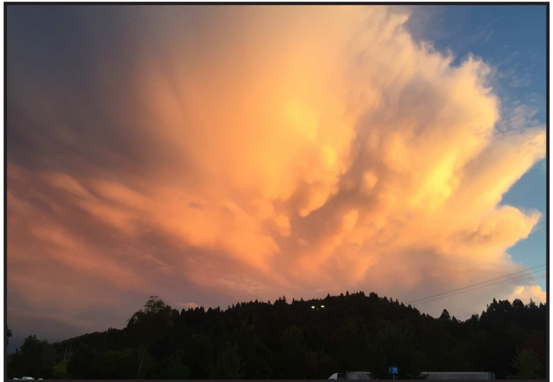
A picture of the sky provided by Leah Cooper.