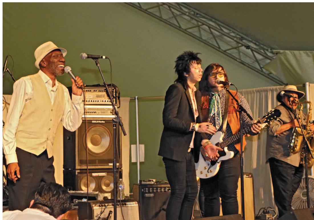
Concert-goers adorned in togas take photos (top) as Otis Day (above left) performs with The Cry! from Portland, Ore., during Saturday night's musical celebration.

RETAIL & COMPOUNDED PRESCRIPTIONS PET MEDS VACCINES FAST & FRIENDLY